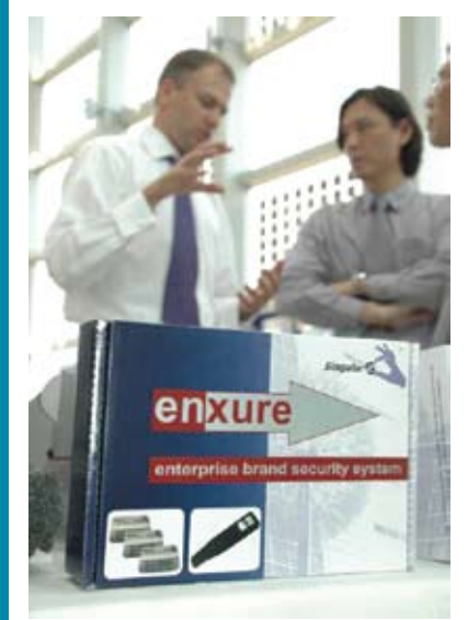
Figure 1. Bilcare Technologies' Singular ID brand security system allows secure authentication from virtually anywhere in the world.

Remote Database - The database provides the brand owner with a very high level of flexibility and control over its products. Different scanners can have different access privileges to the data – for example an authorized distributor